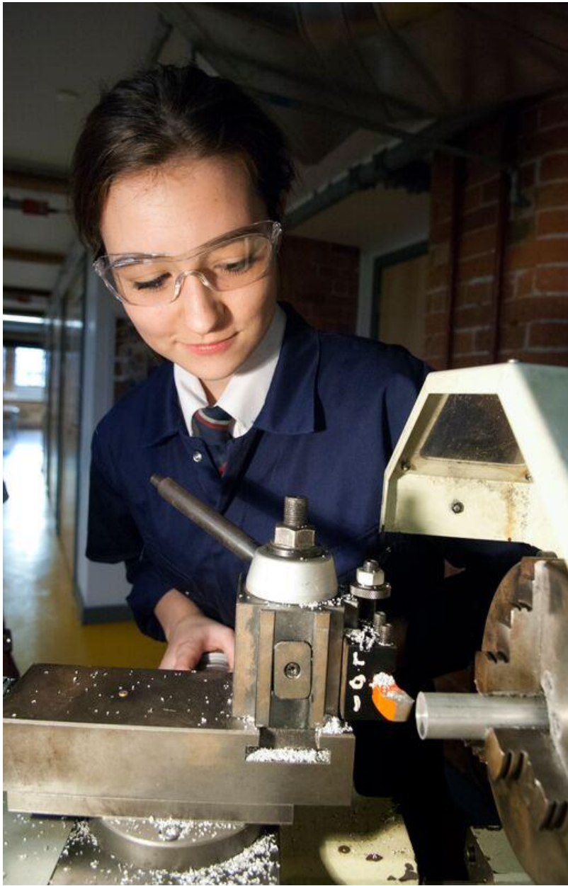
The JCB Academy