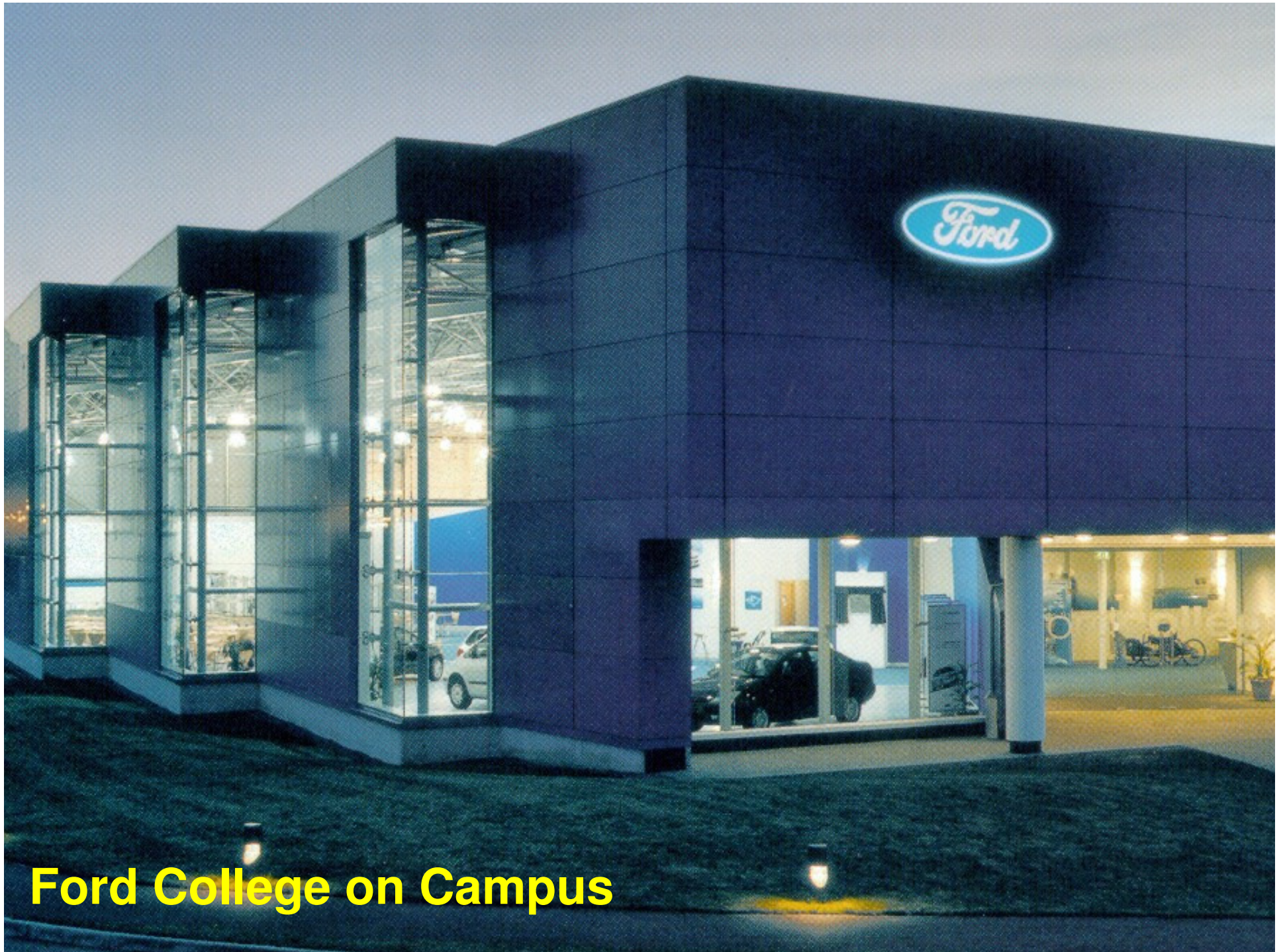
Ford College on Campus