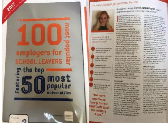
Article about my journey in the GTI 100 most popular employers for school leavers.