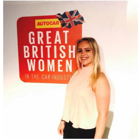
Autocar top 100 for the Great British Women in the Car Industry 2017