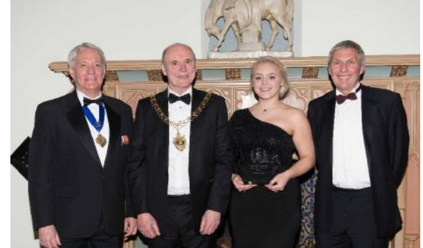
Freeman's Guild of Coventry Apprentice of the Year 2016